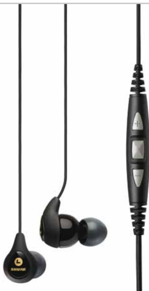
SE115m+ Sound Isolating™ Headset with Remote + Mic