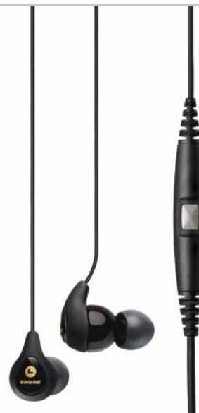
SE115m Sound Isolating™ Headset