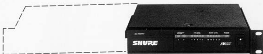
FIGURE 4 ABBILDUNG 4 FIGURA 4

RACK-MOUNTING DUAL UNITS WITH WA502 MONTAGE CÔTE À CÔTE DE DEUX RÉCEPTEURS DANS UN SEUL EMPLACEMENT DE BÂTI AVEC WA502 MONTAGE VON ZWEI EMPFÄNGERN SEITE AN SEITE MIT WA502 IN EINEM 19"-RACK MONTAJE LADO A LADO DE DOS RECEPTORES EN UN ESPACIO DE BASTIDOR CON WA502 MONTAGGIO DI DUE RICEVITORI FIANCO A FIANCO SU UNA RACK CON WA502